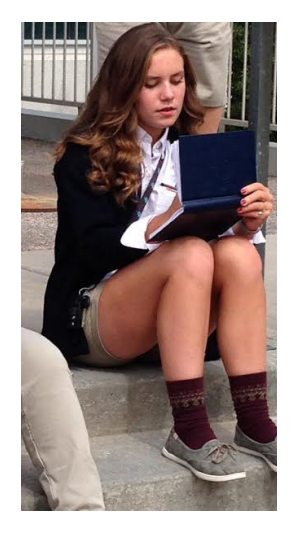
"Art is not what you see, but what you make others see."